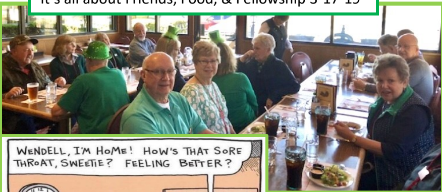
And this is wearin' of the green!