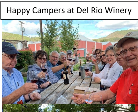
Happy Campers at Del Rio Winery