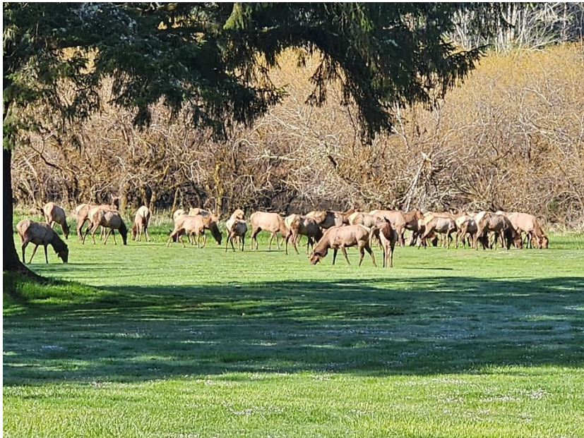
Elk are technically not invited, but we sure love seeing them visit!