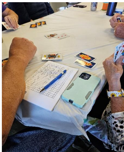
Pinochle, Hand & Foot, Cribbage, Wizard, and card Bingo. Were you a winner?