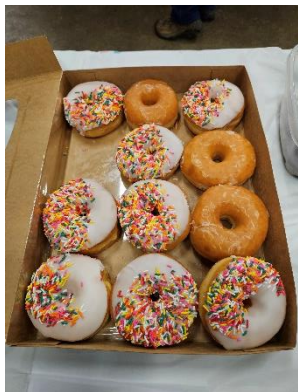
Food, food, and more food. We never seem to go hungry!