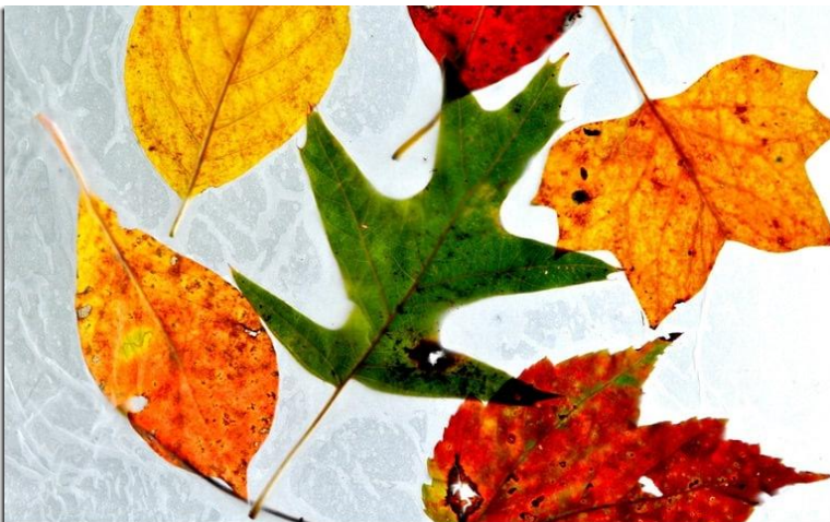
Leaves encased in wax paper.